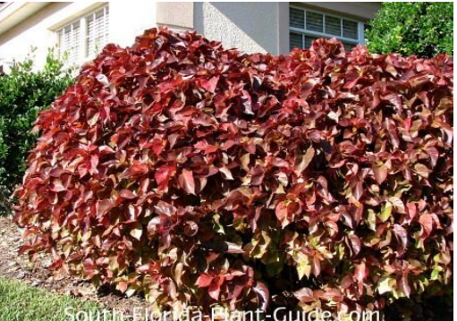
Copper Leaf Plant