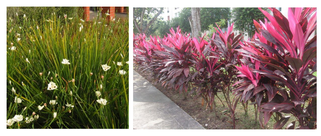
African – Iris