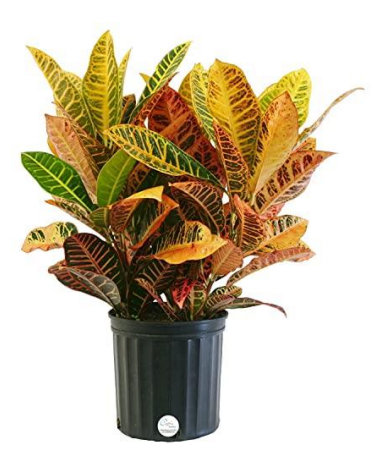
Croton (Previously Approved for 1 House)