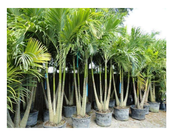
Christmas Palms (Previously Approved for 1 House)