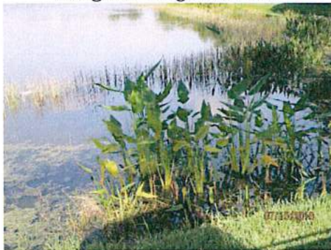
Alligator Flag in Lake 1