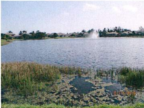
Lake 3 as of 7/15/19