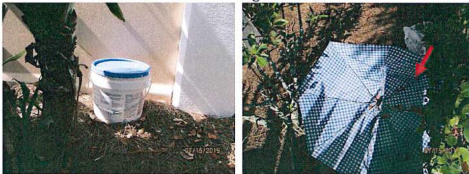
Trash observed along Gladiolus Road