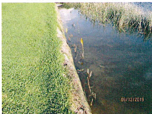
New Littorals in Lake 7