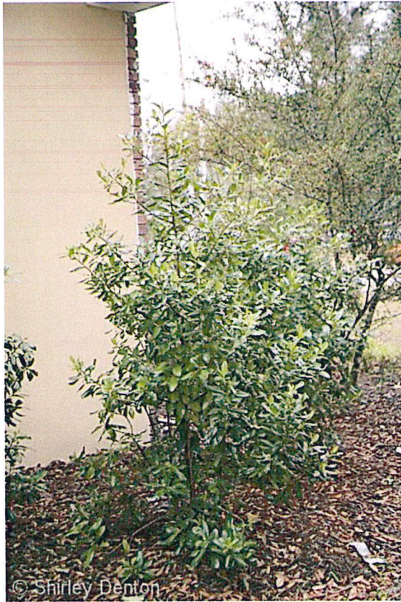
Myrsine – Plant used on berm as second hedge row